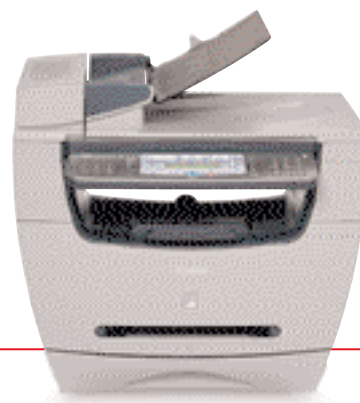
built-in network connectivity: LaserBase MF5770