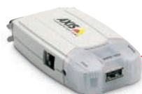
network connectivity through the optional AXIS 1650 Print Server: LaserBase MF5750 / LaserBase MF5730

The LaserBase MF5770 provides built-in network connectivity, so everyone in your office can easily share productive printing resources - direct from each networked PC. The Remote User Interface allows users to view the machine status from their workstations, and administrators can change settings from a central point. Network connectivity can be optionally installed in the LaserBase MF5750 and LaserBase MF5730 through an AXIS 1650 Print Server.